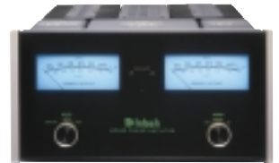
MC352 POWER AMPLIFIER