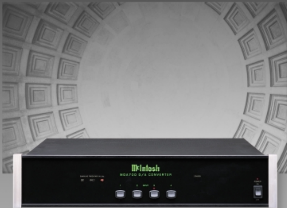
MDA700 D/A Converter